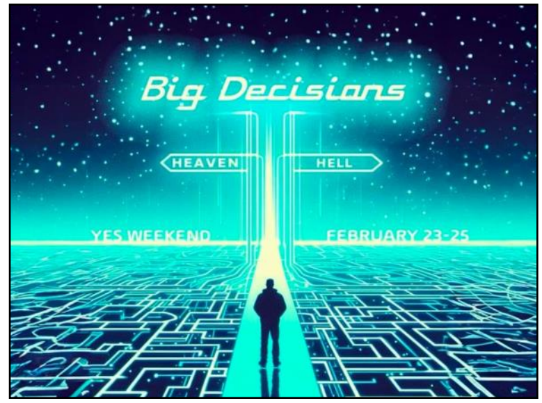
Deadline to order YES t-shirts is Fri., February 9<sup>th</sup>!

Make your plans to attend all sessions during the weekend. Sign-Up sheets are at the Welcome Center.